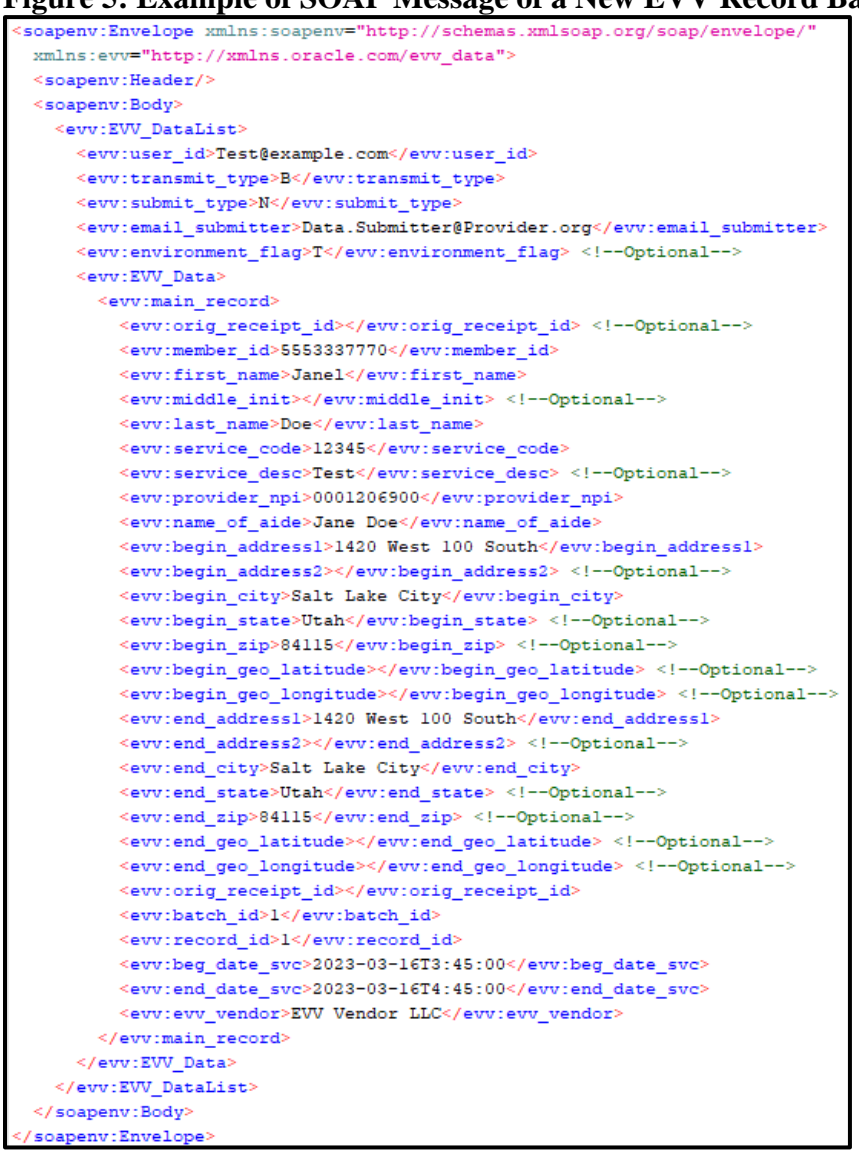
Figure 5: Example of SOAP Message of a New EVV Record Batch

Below are some examples of SOAP messages for transmitting data files for a new and a correction EVV record in a submission batch.