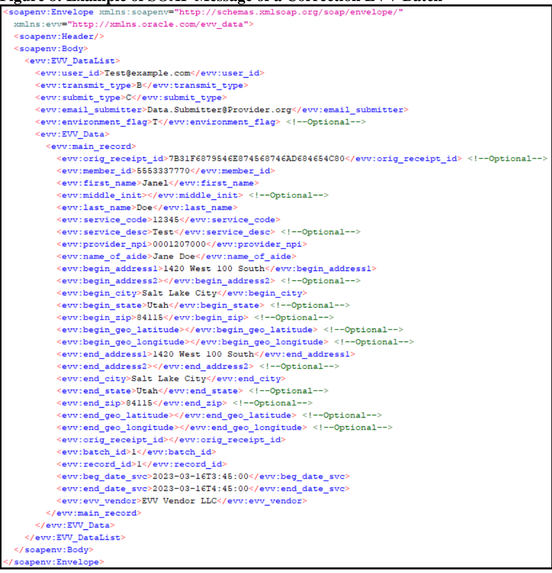
Figure 8: Example of SOAP Message of a Correction EVV Batch